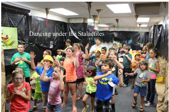
Dancing under the Stalactites