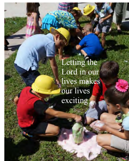
Letting the Lord in our lives makes our lives exciting