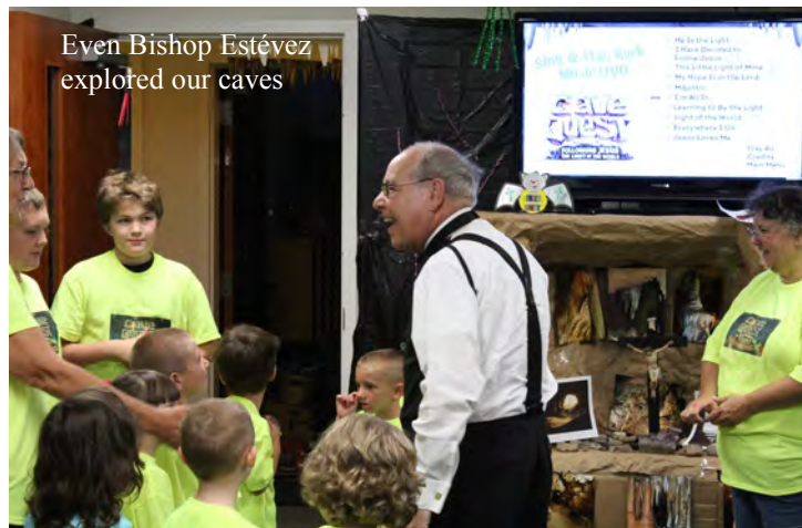
Even Bishop Estévez explored our caves