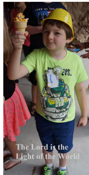
The Lord is the Light of the World